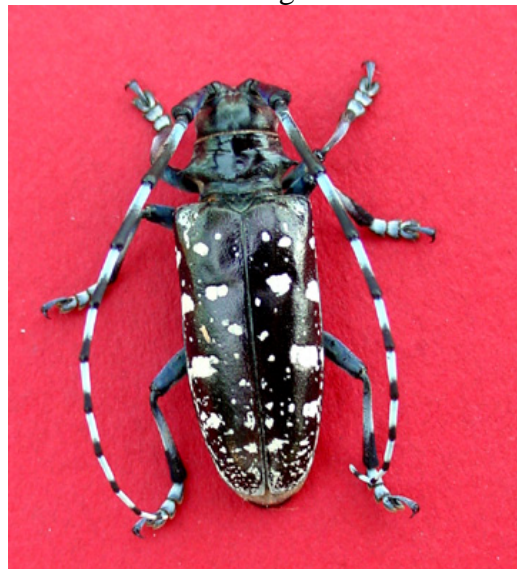
Female Asian long horned beetle

An infestation of the Asian long horned beetle has been discovered in Worcester. Larvae of the beetle feed on hardwoods and it has the potential to decimate New England forests. The beetle is large; about 0.75-1.25 inches long with very long black and white antennae . The body is glossy black with irregular white spots. The current area of concern includes parts of Worcester, Shrewsbury, Holden, Boylston and West Boylston. If you see one, capture it in a jar and put it in the freezer for 24 hours to kill it. It is important that the beetle be properly identified because there is a native beetle (the pine sawyer beetle) with similar characteristics. Report any sightings to the Worcester Regional Field Office of the USDA, 508-799-8330 or the MA Plant Pest Hotline at 617-626-1779. Sightings can also be reported on-line at: http://www.massnrc.org/pests/albreport.aspx . See the following link and the FUSF web site for more information. http://www.uvm.edu/albeetle/identification/index.html