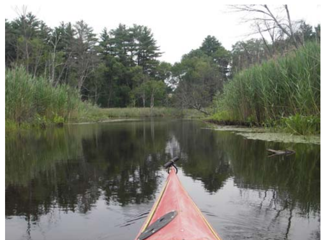
West River Phragmites